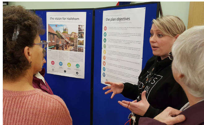
Community Engagement for Hailsham Neighbourhood Plan