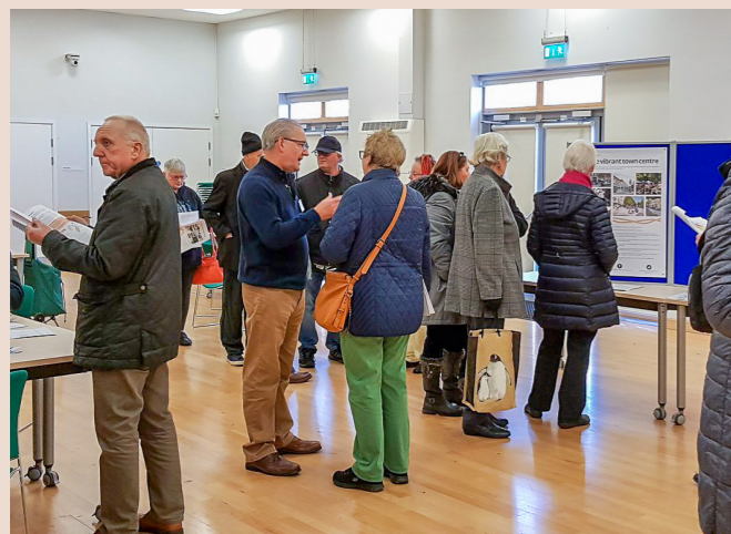
Community Engagement for Neighbourhood Plan Development

Since 2011, communities across the country have used Neighbourhood Plans as a means to help improve quality of life and shape changes in the places they live. Over 2,300 Parish and Town Councils and Neighbourhood Forums have embarked on preparing a Plan, and more than 500 have been approved by referendum.