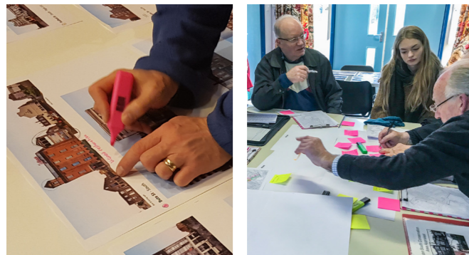
Community Engagement on Conservation Planning